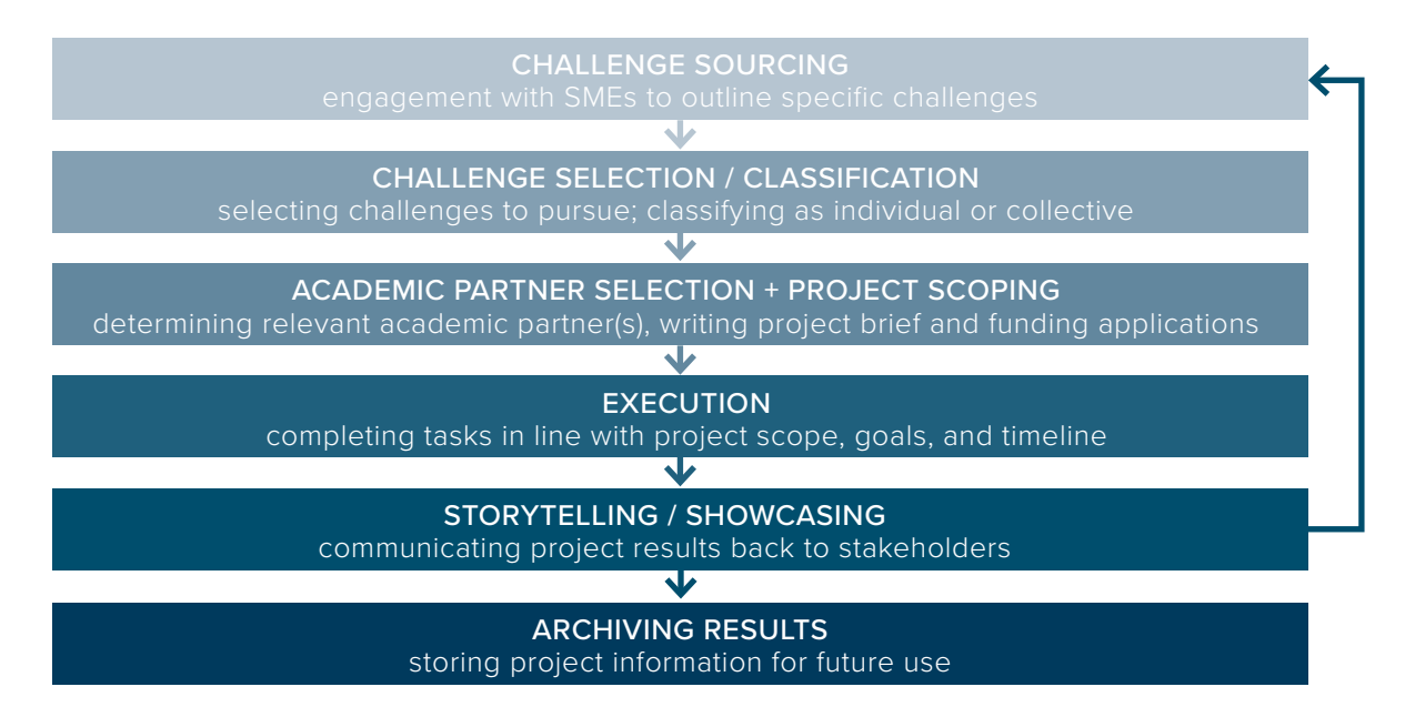
FIGURE 4: EASI Partnerships Program Stages

Three options were explored for developing a formal Environmental and Social Impact Partnerships Program through the VEC. Each option follows the stages shown in Figure 4 and assumes the program should aim to use knowledge from one project cycle to feed into subsequent challenges. The application of this framework to various program options is outlined in the following sections of this report.