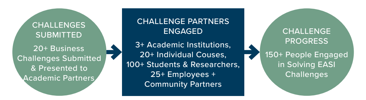
FIGURE 5: Campus Course Model Anticipated Outcomes

The campus courses model offers the opportunity to engage broadly with partners to strengthen ties between Vancouver's academic institutions and SMEs. Targeting 20 matches per year (10 in fall term, 10 in winter) the potential impacts are significant. Figure 5 estimates these impacts based on what CityStudio currently achieves with their programming . The CityStudio program has all students in a partner course working on the identified challenge ( ^{\sim}25 students per class). This yields a much higher student engagement than if only one or two groups within a class ( ^{\sim}5 – 10 students) work on the matched problem.