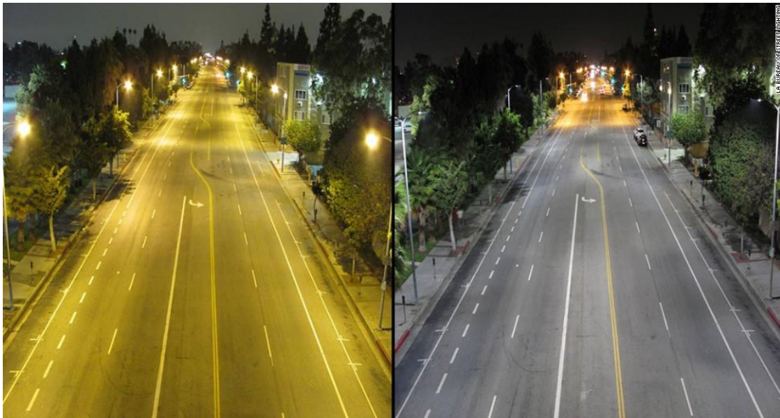
LED streetlight illumination (right) compared to HPS (left)