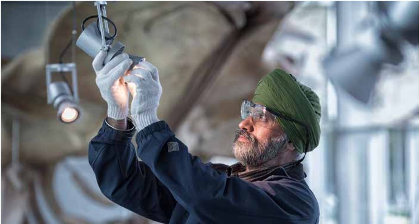
LED Lighting Retrofit

In partnership with BC Hydro, UBC Energy & Water Services implemented the building tune-up (Continuous Optimization) program in 2010 for UBC’s core and academic buildings. Buildings will maintain their optimized states through real-time performance monitoring and analysis to identify further conservation opportunities. UBC further expanded this program in 2019, as BC Hydro’s first customer to participate in the real-time energy management program, designed to identify and correct building inefficiencies as they arise.