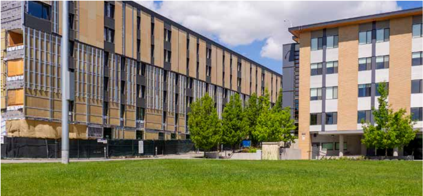
2019 construction of the Skeena Housing targeting completion in 2020.

In 2019, UBC Okanagan was awarded CleanBC’s Better Buildings Net-Zero Energy-Ready Challenge’s Construction and Design Incentive Award for Skeena Residence, its first Passivhaus Project. The Net-Zero Energy-Ready Challenge (NZERC) is one of CleanBC’s programs aimed at making buildings all over the province less polluting, more comfortable and energy-efficient. Net-zero energy-ready buildings are designed and built to be so efficient that they could meet all or most of their own energy consumption requirements with renewable energy technologies.