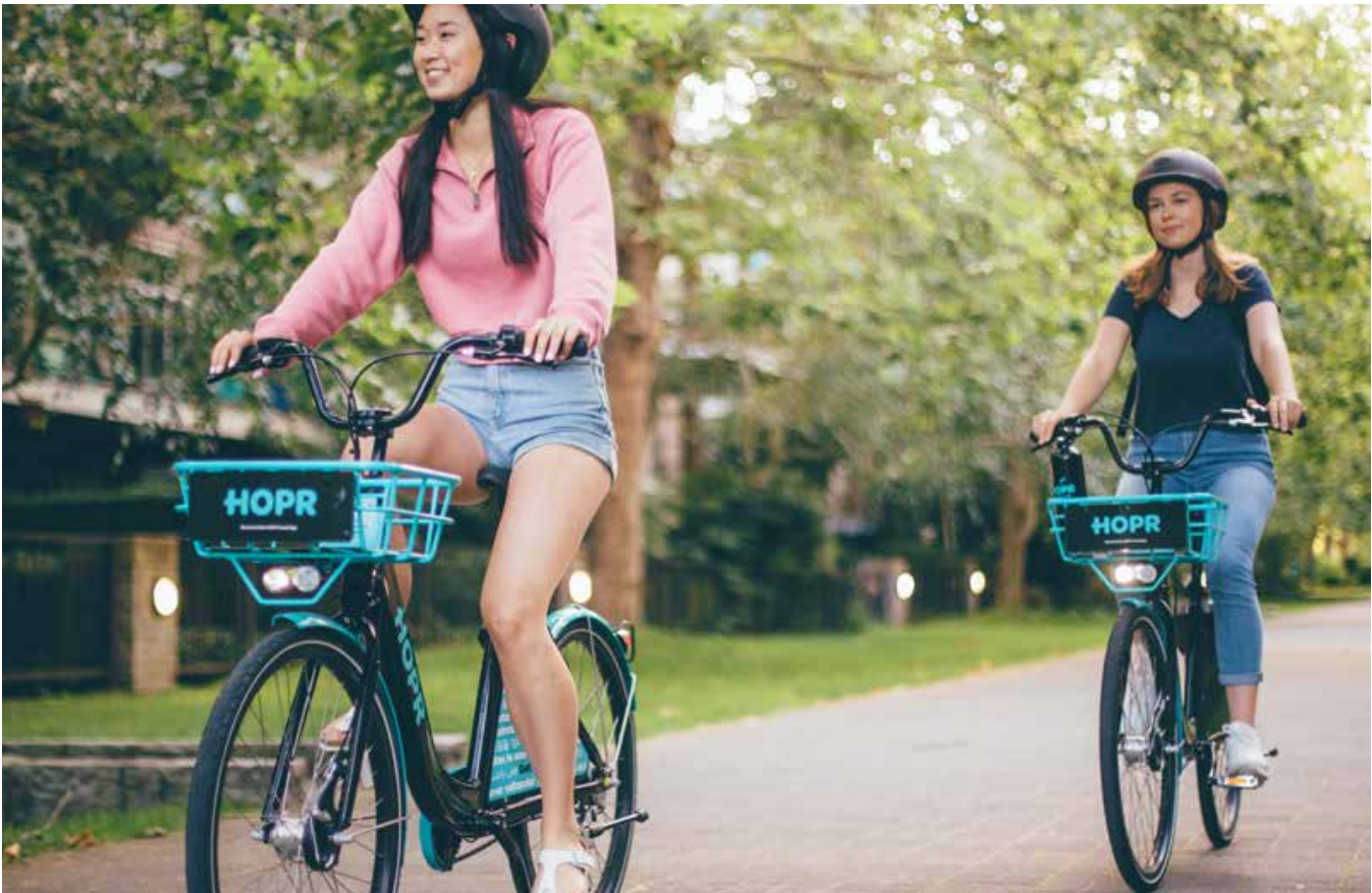
Campus Bike Share Program

UBC administers a campus-wide hub-based bike share program to enable employees, students and residents to get around our 1,000 acre campus quickly and easily without the use of a personal vehicle. Since launching in August 2019, the bike share program has seen nearly 50,000 rides covering over 80,000 kilometers. The service provides an important first and last-mile