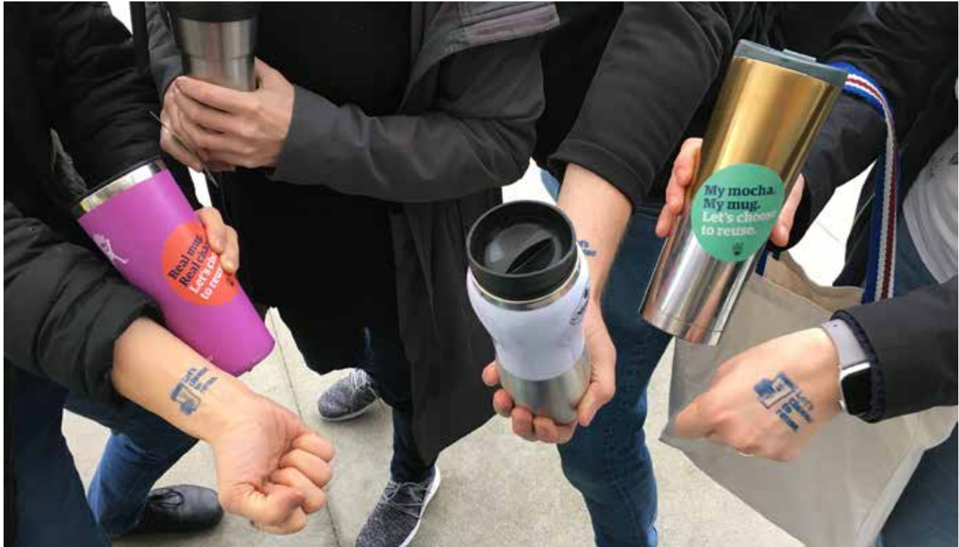
Zero Waste Foodware Strategy

While UBC is not required to offset scope 3 emissions (except paper) under the Provincial regulations, a number of initiatives are underway to measure and reduce Scope 3 emissions.