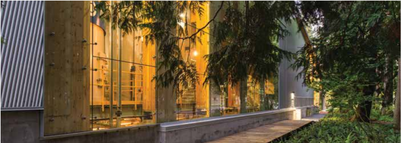
Bioenergy Research and Demonstration Facility

The Vancouver Campus Climate Action Plan (CAP 2020) set bold GHG reduction targets from a 2007 GHG baseline, a 33% reduction target for 2015 (achieved in 2016), a 67% reduction target for 2020 (the upcoming Bioenergy Research and Demonstration Facility expansion will bring UBC close to this target), and a 100% reduction target for 2050. This plan has enabled significant success, achieving large operational savings, improving efficiency of buildings, increasing our resiliency and building a strong reputation as an international sustainability leader.