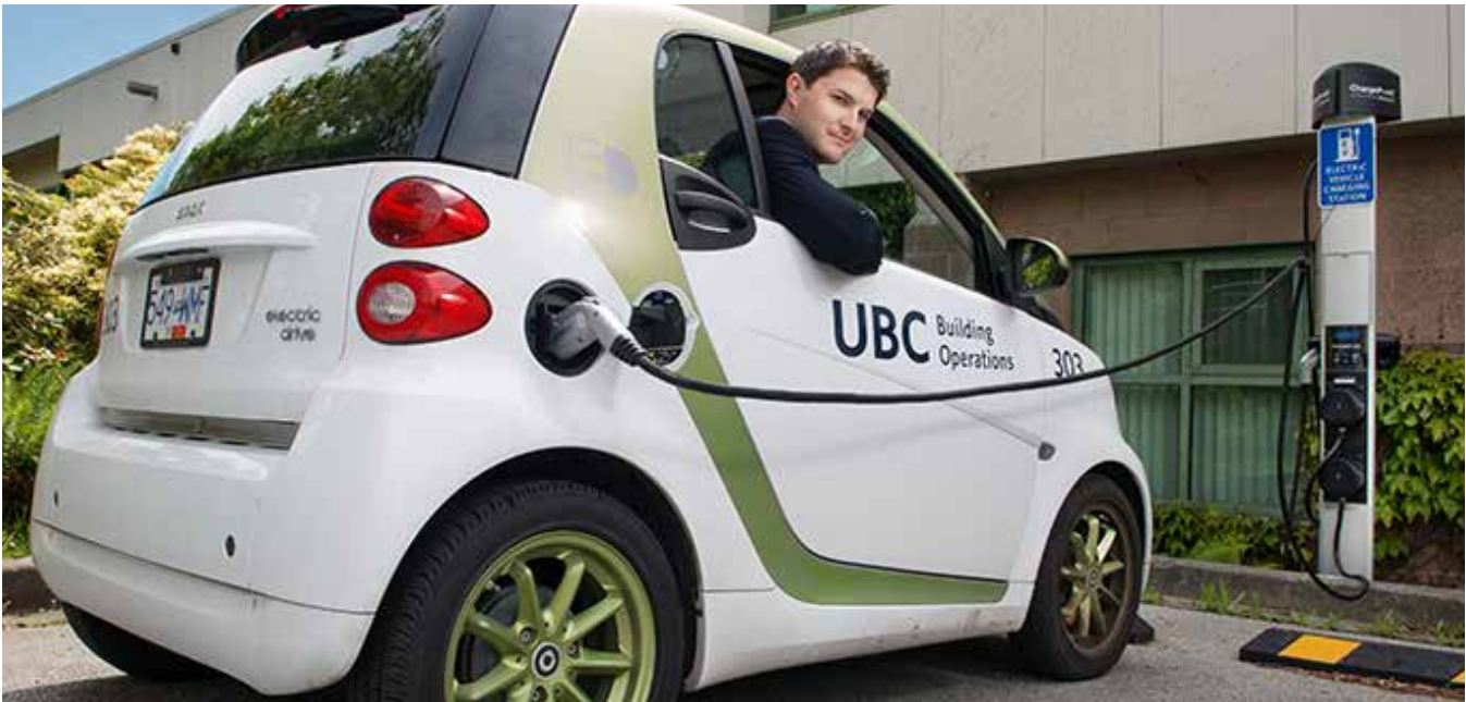
Electric Vehicle Charging Infrastructure

Green Fleet Plan, continued driver training on fuel efficient driving practices, and further increased our supply of electric vehicles.