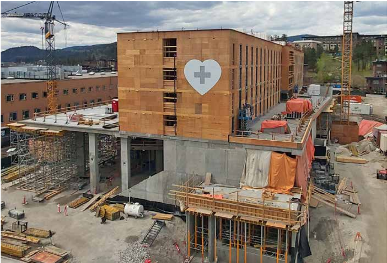
2019 construction of the Nechako Housing Commons targeting completion in 2021.

The campus will continue the development of the Climate Action Plan, in alignment with the increased ambition of UBC’s Climate Emergency Declaration for completion in Spring 2021. The vision, scope and schedule of activities are underway, with the first step of integrating emerging campus operations themes of the Climate Emergency engagement process. The plan will leverage and integrate parallel planning efforts, cross-campus climate action planning efficiencies, and the wider community engagement process. The plan will also include additional Scope 3 GHG reduction opportunities such as commuting, low carbon food, and embodied carbon.