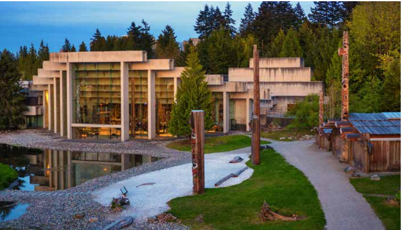
Museum of Anthropology

UBC plans to continue replacing inefficient and older equipment and conduct preventative maintenance and upgrades to refrigeration/air conditioning equipment to minimize refrigerant leakage.