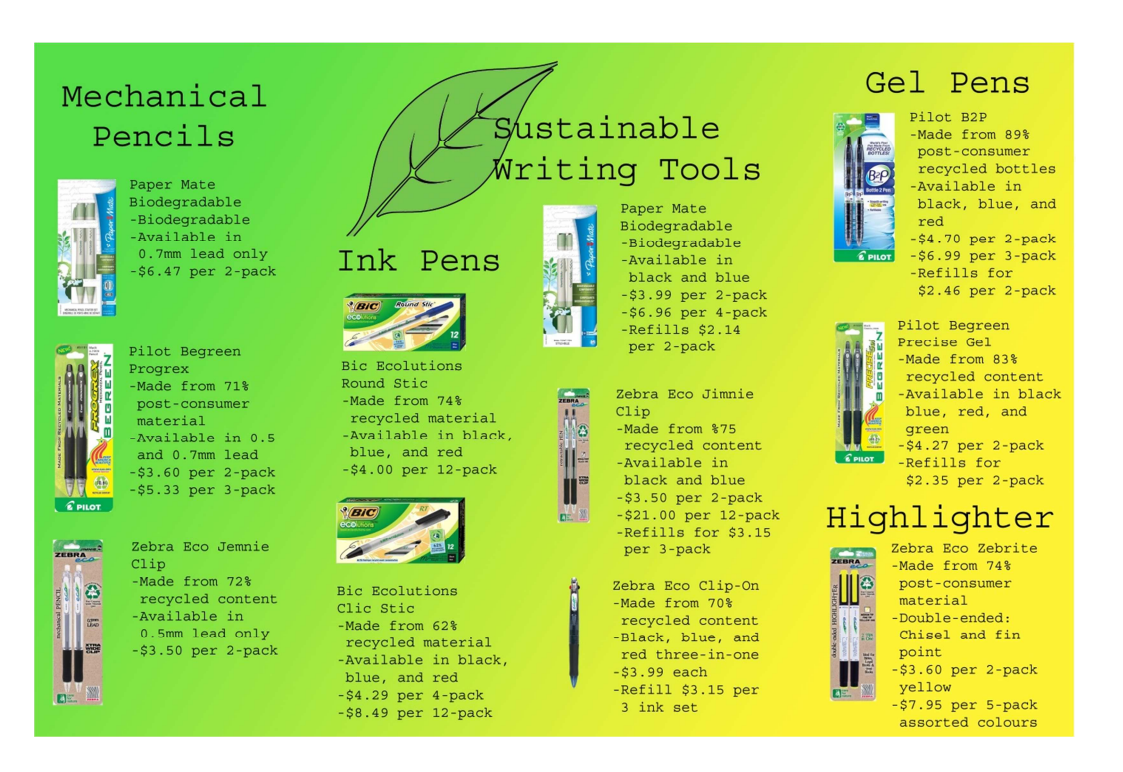
Figure 1: Poster used at survey booth.

In order to narrow down product selection, a survey booth was set up at UBC's SUB. The booth comprised of sample stationery supplies, a poster, and survey sheets. The sample stationery comprised of eco-friendly pens, mechanical pencils, and a highlighter for students to inspect and use. A variety of products were chosen for display to analyze the interests of the students. Factors that reflected the student's purchasing decision were the look, feel, price, and if it could be refilled. The poster indicated what made each writing tool sustainable, the prices they were likely to be sold at in the vending machine, and the cost of refills if available. The survey sheets asked which of the displayed products would be bought if the person had to buy new stationery, and if they would refill their pens. On the backside of the page was an extended survey asking for preferences in pens, pencils and highlighters not relating to the displayed products. The survey sheets are in Appendix A. The poster used is displayed in Figure 1.