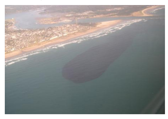
Figure 2: Visible Effluent Discharge from the Georgia-Pacific Pulp Mill in Toled

There are many initiatives for clean water for distillery purposes at the production facility in India. The bleaching process of the wheat paper uses hot water with a sodium salt and oxygenation process rather than using chlorine gas and chlorine dioxide or peroxide as bleaching agents, making the production of wheat paper effectively chemical free. The hot water in the wheat paper mill is recycled over and over again with no effluent coming out of the facility. For wood pulping at chemical pulp mills, chlorine gas and chlorine dioxide are highly toxic and pose a severe health risk by acting as a mutagen or carcinogen and may be fatal. Moreover, waste water, leachate and run-off can contain toxic substances that can potentially pollute other fresh water sources and farmlands. High biological oxygen demand and chemical oxygen demand effluent consume the dissolved oxygen in water, potentially causing aquatic lives to be suffocated (Borromeo, 2008). There are no effects on human food chains that go into grains, bio fuels, or other animal food chains because all of the wheat straw is waste. The wheat paper can be recycled the same way as all other wood fibre papers because the molecular decomposition of eucalyptus is the same. The process of creating wood fibre paper includes debarking, chipping, pulping, bleaching, and pressing/drying. With wheat fibre paper debarking and chipping is unnecessary, effectively removing two steps from paper production (Borromeo, 2008).